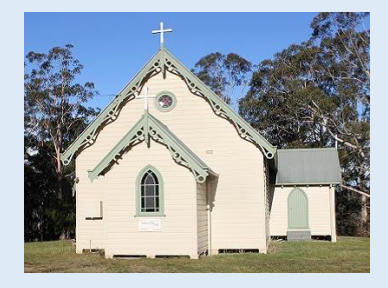
Whoever comes to me will never be hungry; whoever believes in me will never thirst.